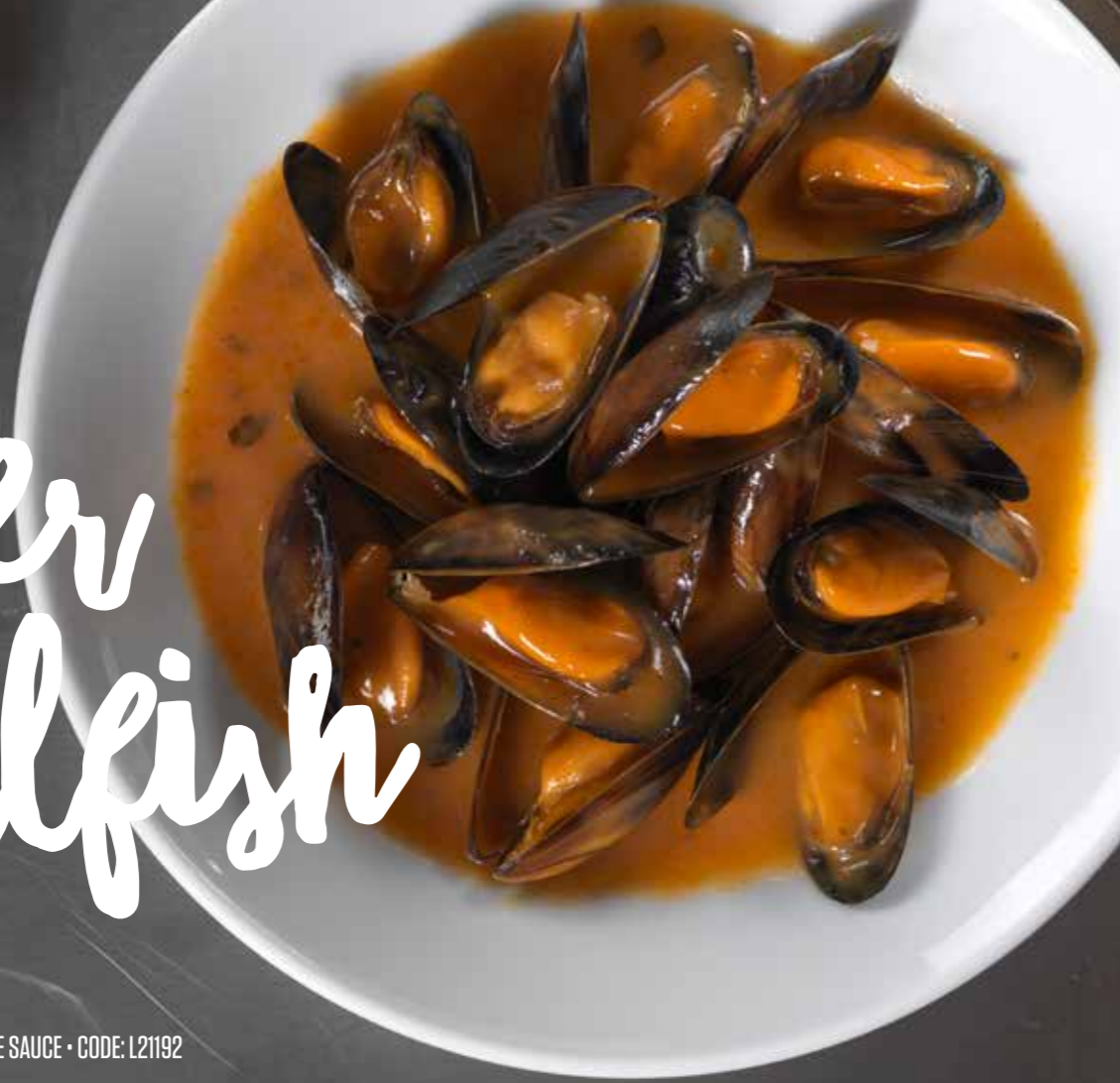
NEW SCOTTISH MSC MUSSELS IN A BISQUE SAUCE • CODE: L21192